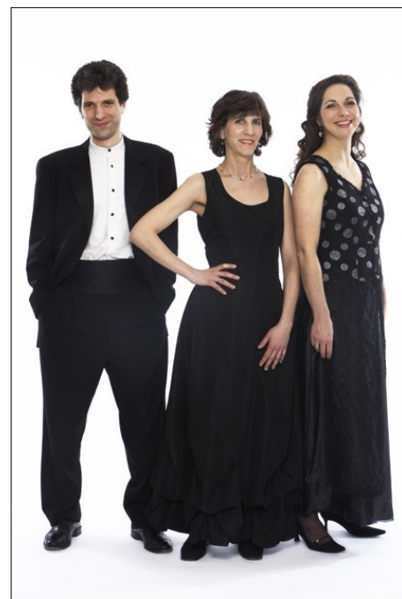
The Peabody Trio