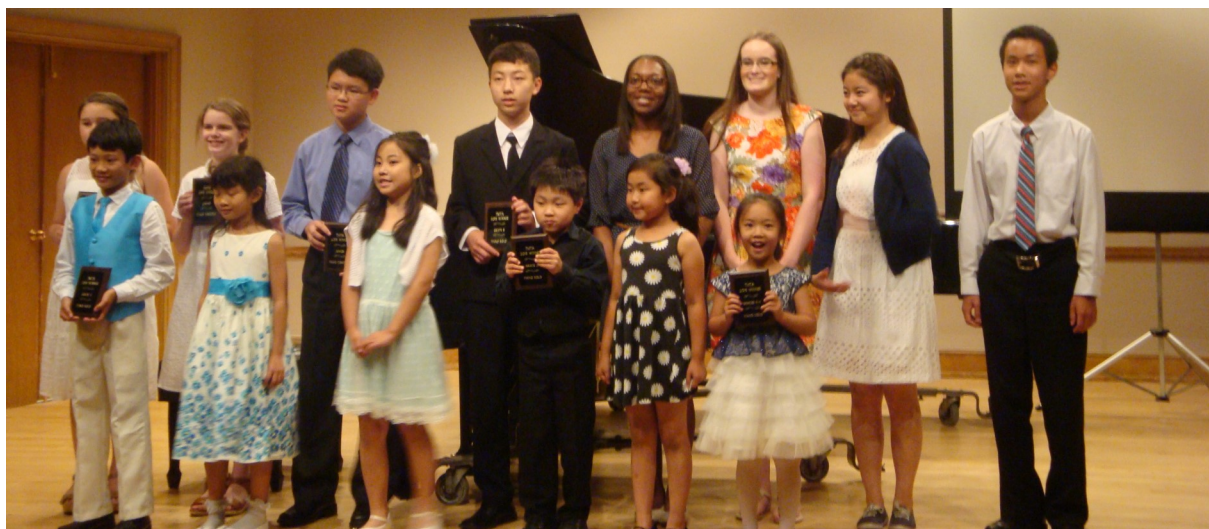
Performers pose following Honors Recital at the State Competitions in June