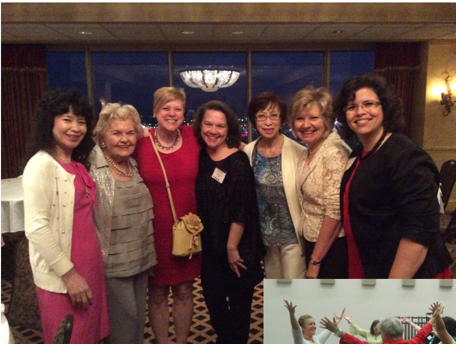
Members reconnect at the Banquet during the State Conference in Chattanooga.